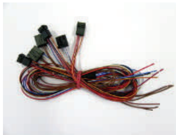
Loom p/n A2C59514545