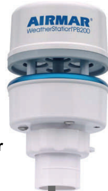
AirmarSensor p/n PB100 or p/n PB 200