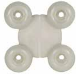
OUTER PISTON 4 Pre-moulded crease