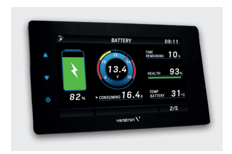
Intelligent Battery Sensor (IBS) screen to keep your energy supplies under control

The embedded NMEA 2000® gateway brings all the sensor readings and alarms to your external multifunctional display, saving the cost of an additional converter.