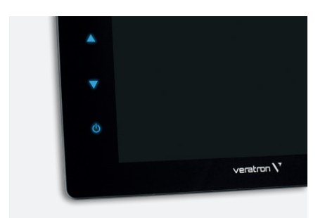
Lateral touch buttons are RGB illuminated and allow for a guick brightness adjustment