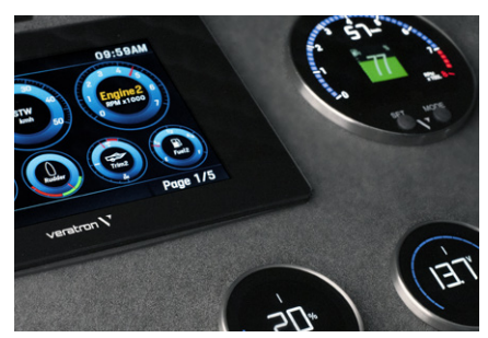
The VMH series look and feel gives an elegant and stylish touch to your dashboard