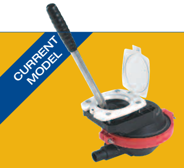
Pictured with Deckplate AS0356